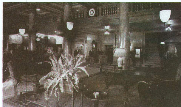
Royal Connaught Lobby in the early forties